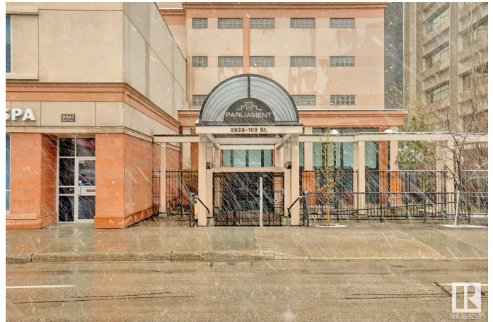
805-9939 109 St NW, Edmonton, AB