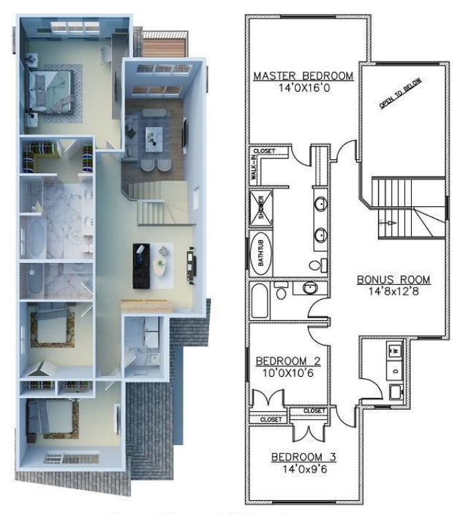
Upper Floor - 1147 sq.ft.

DATA IS DEEMED RELIABLE BUT IS NOT GUARANTEED ACCURATE BY THE REALTORS® ASSOCIATION OF EDMONTON. COPYRIGHT 2025 BY THE REALTORS® ASSOCIATION OF EDMONTON. ALL RIGHTS RESERVED. Trademarks are owned or controlled by the Canadian Real Estate Association (CREA) and identify real estate professionals who are members of CREA (REALTOR®, REALTORS®) and/or the quality of services they provide (MLS®, Multiple Listing Service®)